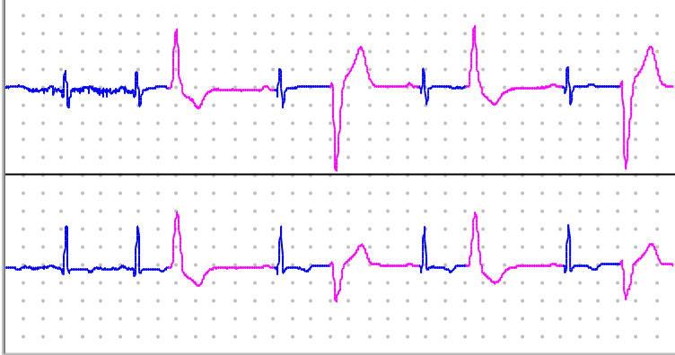
Bigeminy 22:50:50 82 BPM