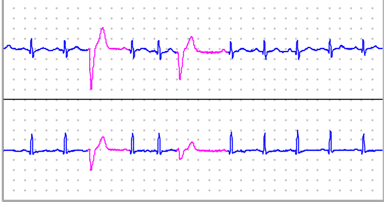
Single VE 18:23:38 98 BPM