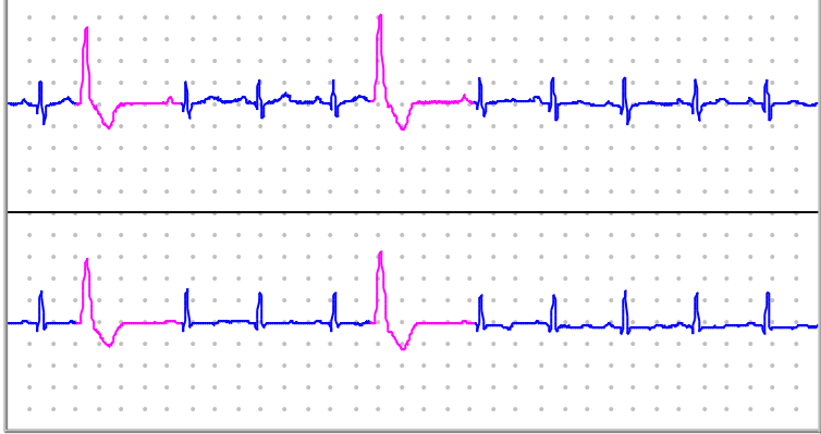
Single VE 18:15:41 96 BPM